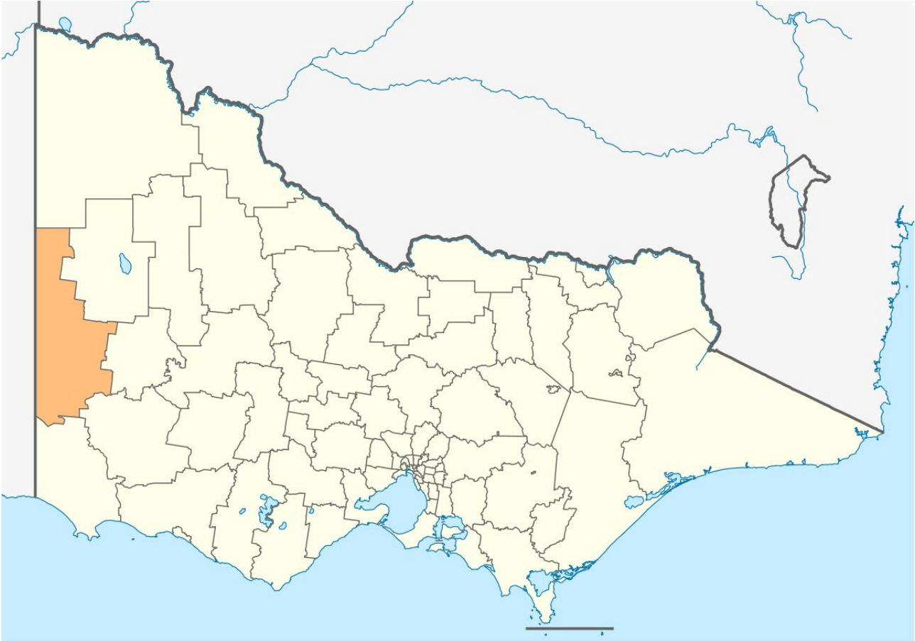
West Wimmera Shire Location Maps