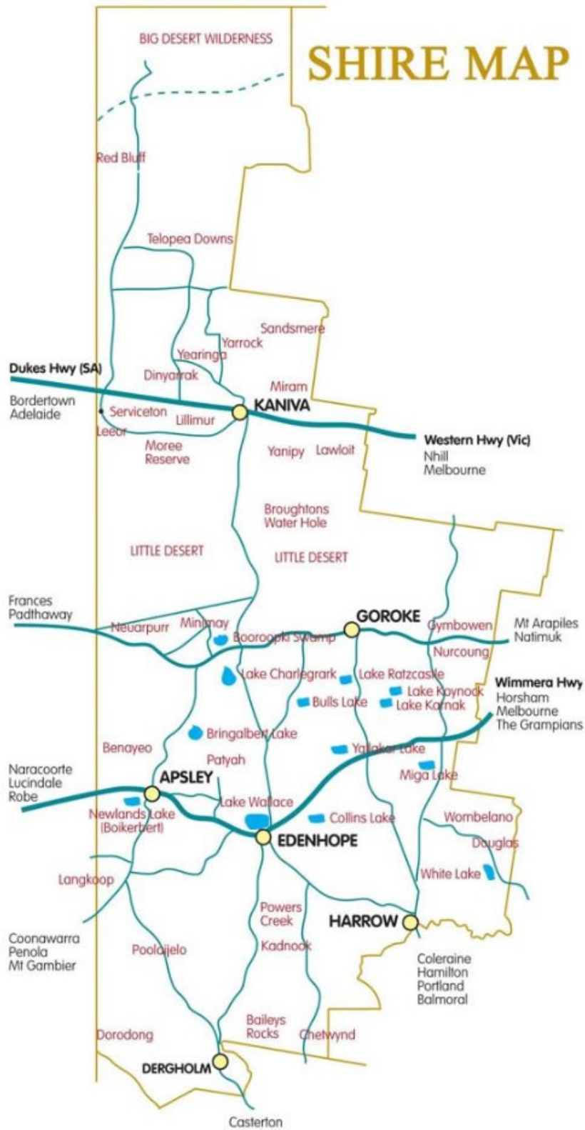
West Wimmera Shire