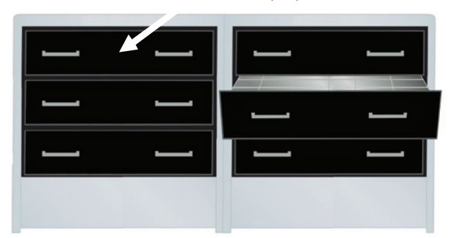
Drawer fronts are opaque

An opaque curtain can be lifted to remove a product