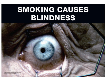
Health warning used with the permission of the Australian Government