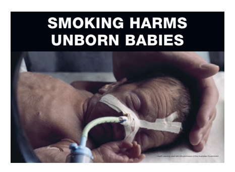
Health warning used with the permission of the Australian Government

If you use a price board, you must display one of these A4 size graphic-health-warning signs on or immediately next to the price board.