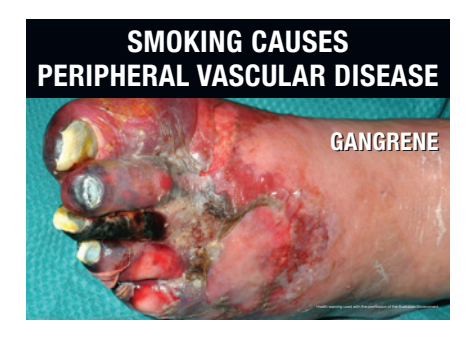
Health warning used with the permission of the Australian Government