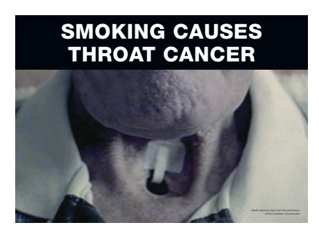
Health warning