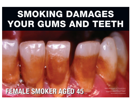
Health warning used with the permission of the Australian Government