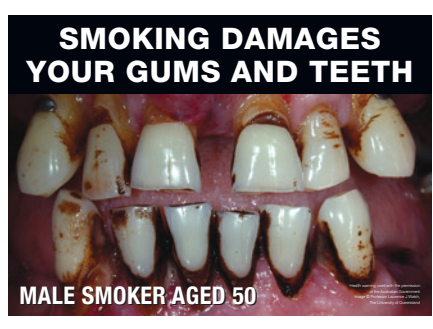
Health warning used with the permission of the Australian Government