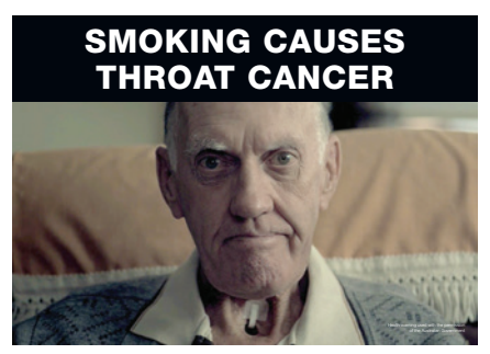
Health warning used with the permission of the Australian Government