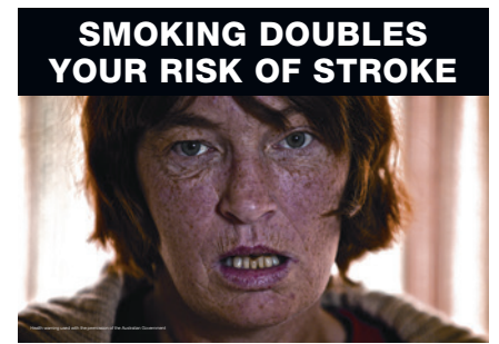
Health warning used with the permission of the Australian Government

These graphic health warnings are used by the Department of Health and Human Services under licence from the Commonwealth of Australia and may only be used as permitted by the Department of Health and Human Services. Graphic health warning signs are available from the Department of Health and Human Services by contacting the Tobacco Information Line on 1300 136 775.